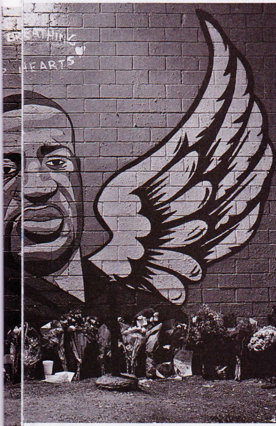
< A mural honoring George Floyd is painted in Houston's Third Ward, where he was raised

neighborhood-watch volunteer who fatally shot Trayvon Martin was acquitted.