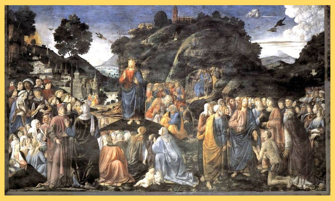
Sermon on the Mount by Cosimo Rosselli, 1481-82, Sistine Chapel, Vatican City