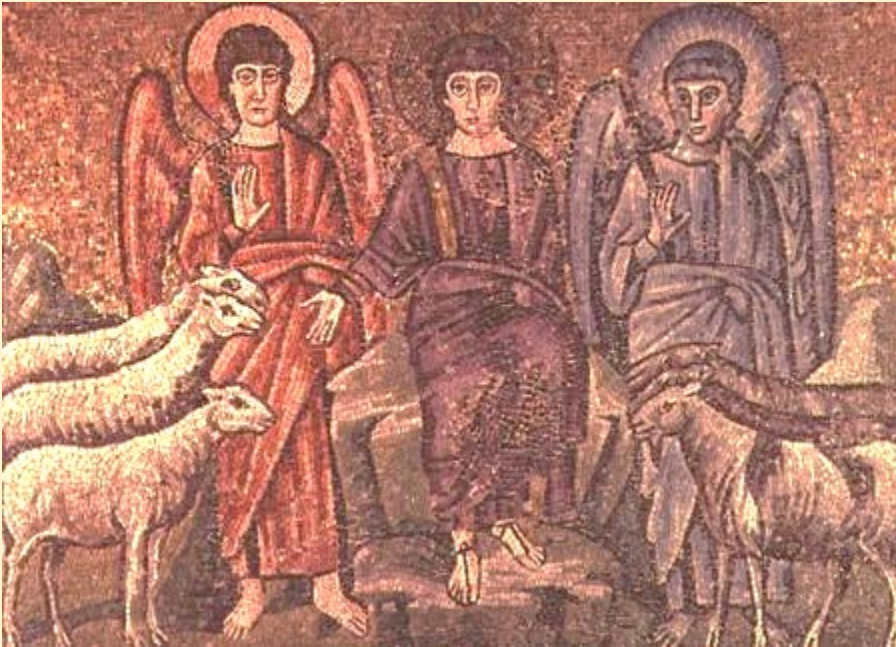
The Anointed Separates the Sheep from the Goats. 6 th century, CE anonymous mosaic. Basilica of Sant'Apollinare Nuovo, Ravenna, Italy

Join the service at 9:30 a.m. Sunday morning: